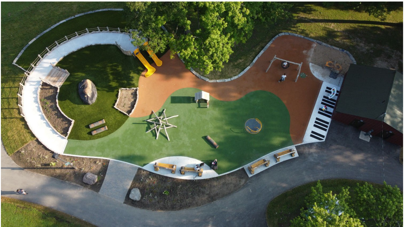
Lions Accessible Playground at Elgin Park